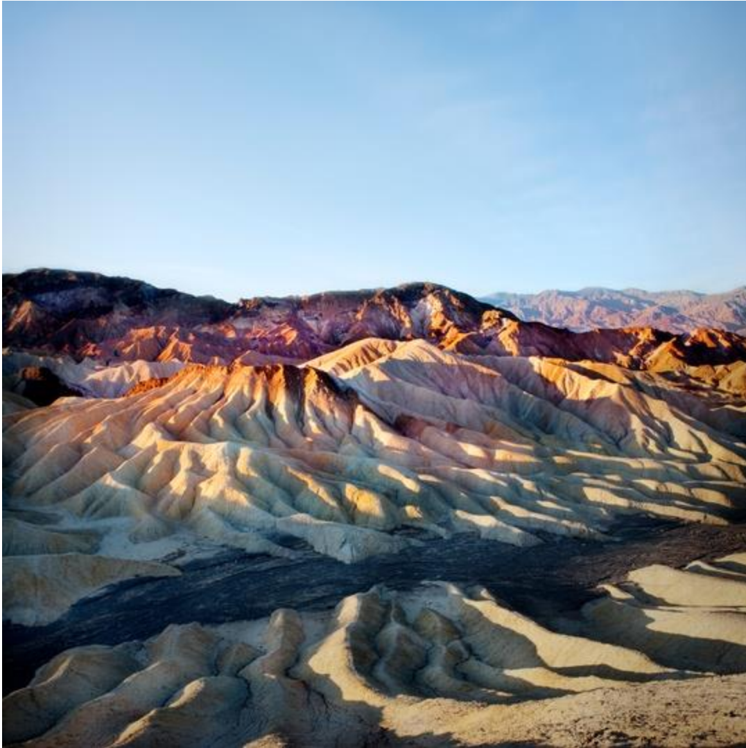
Zabriskie Point in Death Valley National Park Death Valley, California, United States